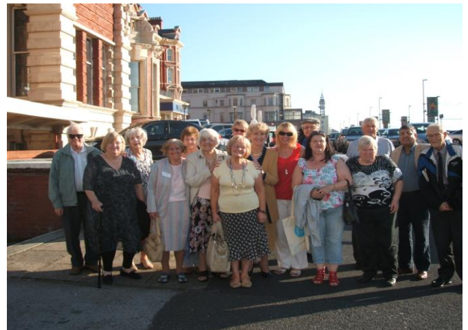
Members of Bury Carers Group, Blackpool